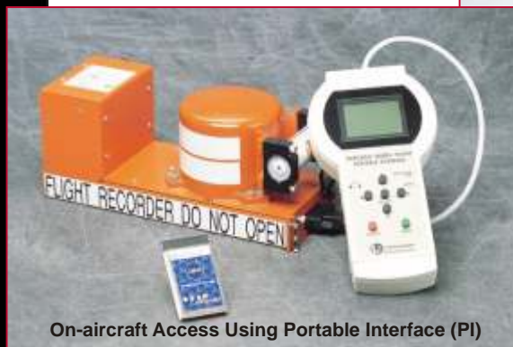
On-aircraft Access Using Portable Interface (PI)