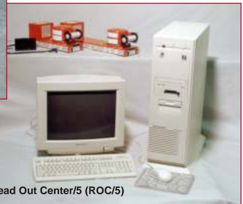
Read Out Center/5 (ROC/5)