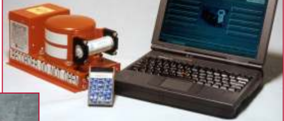
Read Out Support Equipment (ROSE) Analysis Unit (RAU)